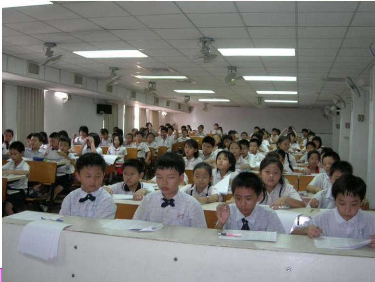
Pretest- for Spelling Contest