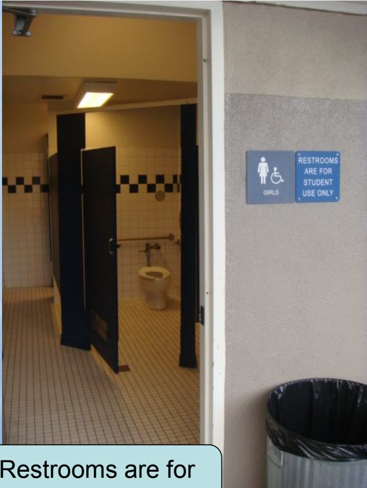
Restrooms are for student use only