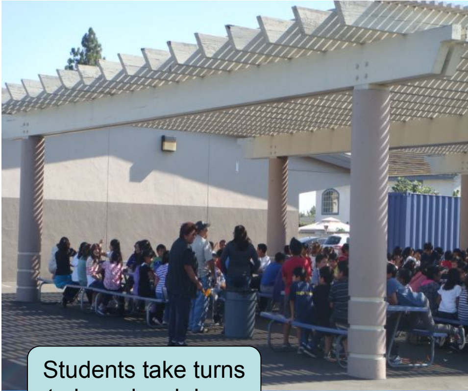
Students take turns to have lunch here