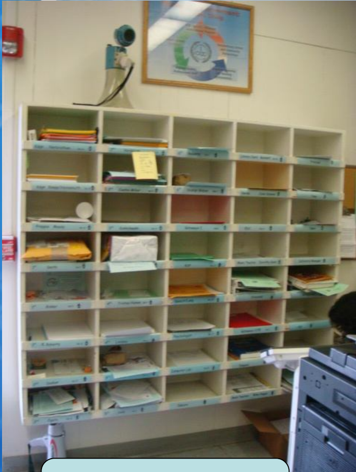
Teachers' information center