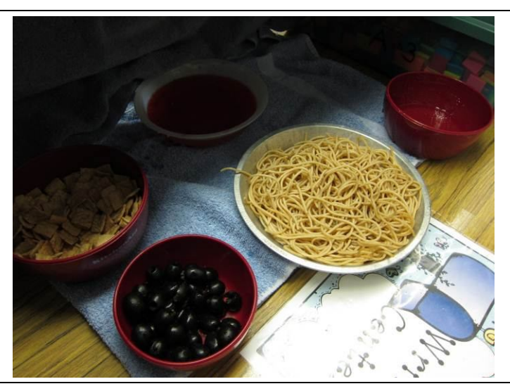
The food behind the towel