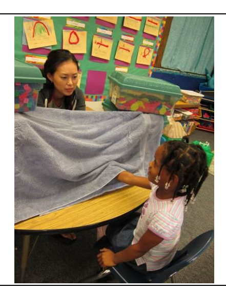
The Five Senses Grab