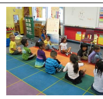
The carpet makes studer sit on the ground neatly