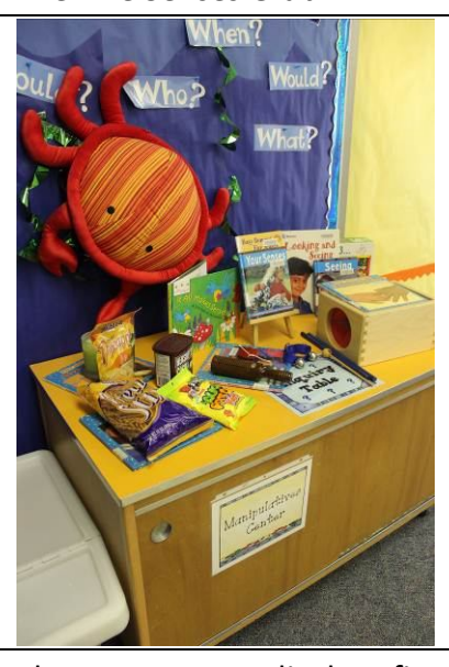
The corner to display five senses related books and toys