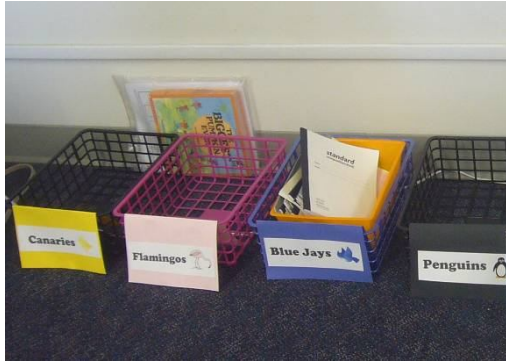
“Students’ works collected according to different groups”